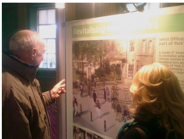
Display in Mansion House 5 th and 6 th March

Following a very successful consultation event at the Mansion House in early March, where 400 people attended over the two day event, the developer is now working towards submitting a planning application in April 2010.